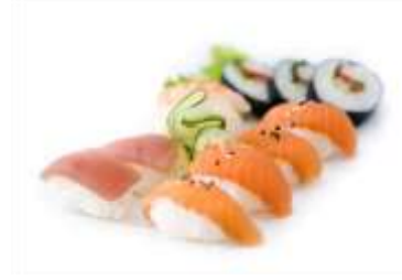
Sushi from Japan