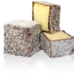
Lamingtons from Australia