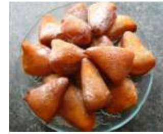
Mandazi from Kenya

The types of foods that people eat are a part of their culture. Traditional recipes are usually hundreds of years old and are made with special ingredients found nearby!