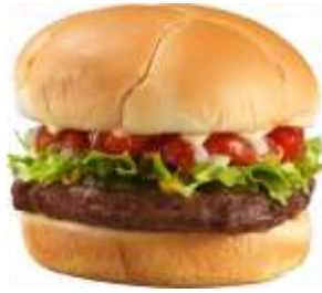
Hamburger from the USA