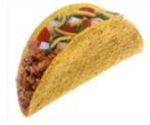
Tacos from Mexico